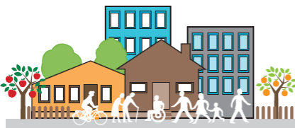
Future Care Plan (FCP) / Advance Care Plan (ACP) (FCP form / ACP form)

However to facilitate a more seamless approach across patients' healthcare journeys and to make key advance directives (such as decisions about resuscitation) more immediately available to acute hospital staff, BOPDHB supports the use of the following framework: