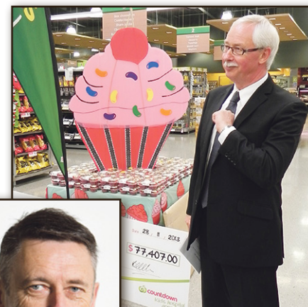
Presenting a cheque for over $77,407.00 at the Countdown Kids Appeal in 2013

Tauranga is one of the fastest growing cities in New Zealand, with more and more people moving here to enjoy the lifestyle on offer. After arriving at his new post 10 years ago Phil picked up the Tauranga Hospital upgrade and drove it to completion, all the while keeping the hospital fully functioning. The extensive refurbishment and modernisation resulted in improved facilities and buildings as well as new technology and equipment, ensuring we will be well served now and into the future.