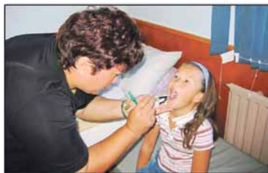
A simple throat swab can determine if your child has a strep throat.

Acute rheumatic fever often starts with a sore throat (a streptococcal infection). A few weeks later the child may develop sore or swollen joints, skin rash, fever, stomach pain and jerky movements. Although these