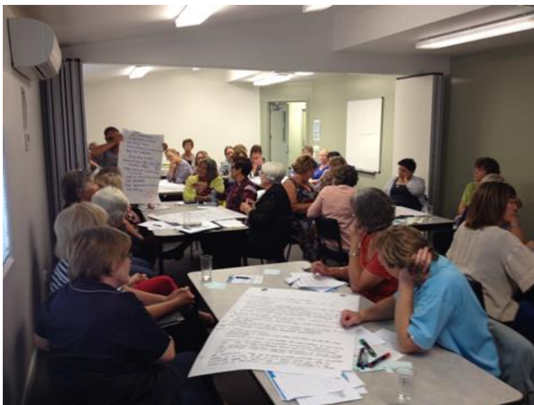
Attendees sharing their ideas at the Open Forum in Whakatane in February 2015